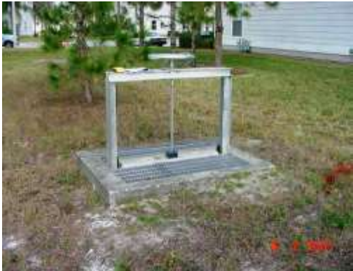
Figure 1: Example of Operable DCS community outfall pipe