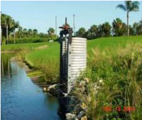
Figure 2: Example of Operable DCS to Community Lake