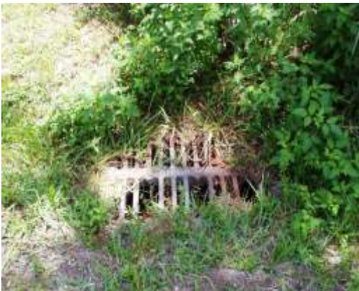
Figure 6: Example of vegetation obstructing flow in drain