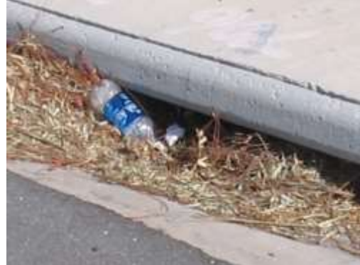
Figure 5: Example of vegetation and trash obstructing flow in drain