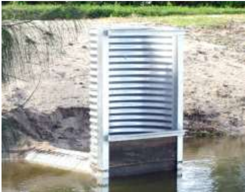
Figure 3: Example of adjustable boards on a Flash Board Operable DCS