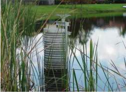
Figure 4: Example water grasses obstructing flow in Operable DCS